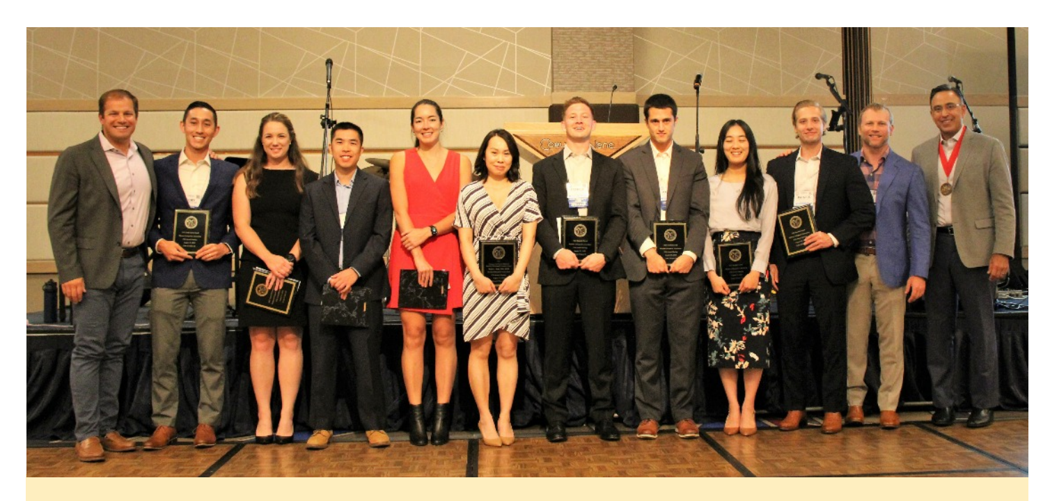
Thanks for a Great Meeting