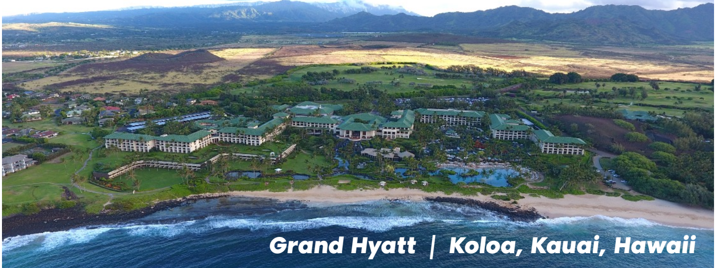
Grand Hyatt | Koloa, Kauai, Hawaii